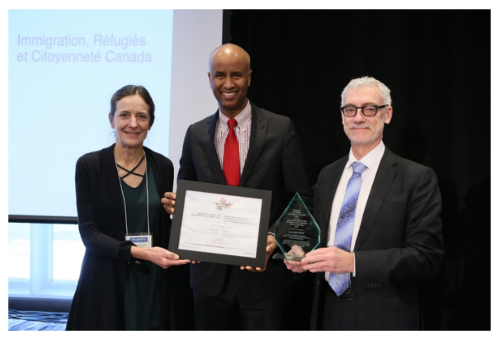
Danby Appliances (Ontario)

2018 winners: Danby Appliances (ON), Paramount Fine Foods (ON) and St.Amant (MB).